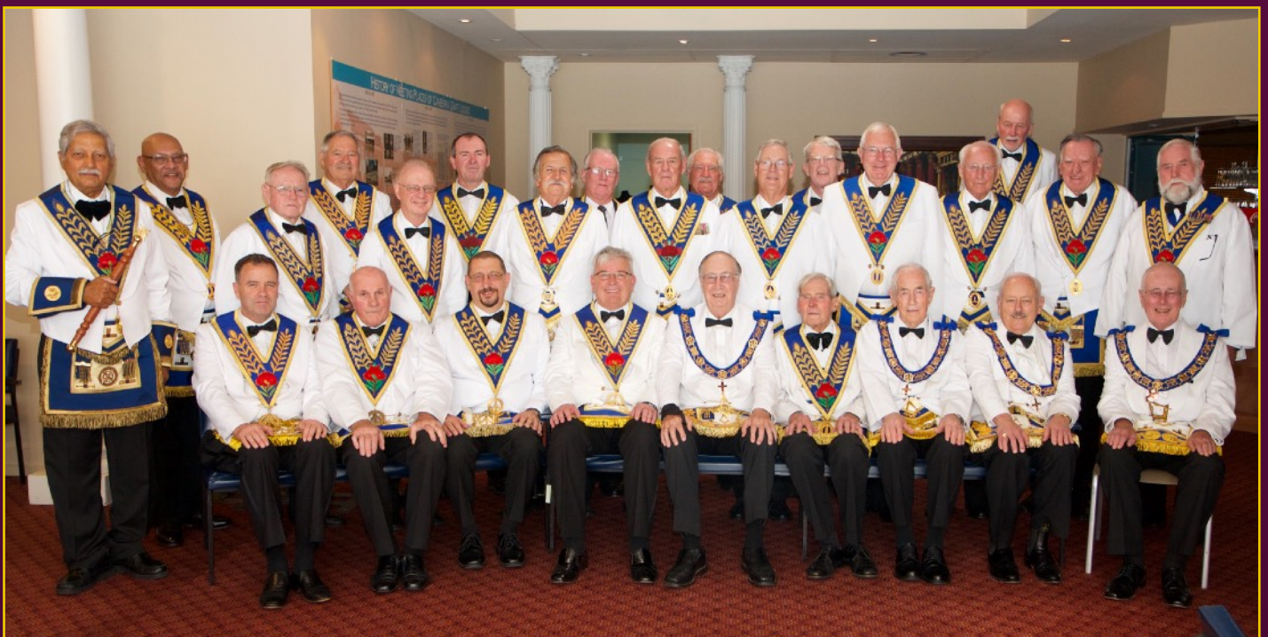
The Grand Lodge Delegation supporting Lodge Capitol's Installation on Saturday, 4th of March, 2017